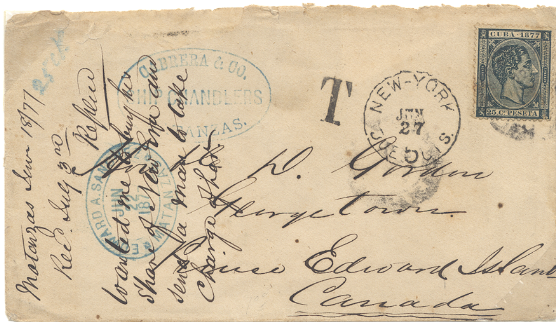
Covers from Santiago de Cuba and Matanzas to New York and Canada respectively, marked with a large "T" and DUE 5 CTS. in New York to indicate 5 cents were due to U.S. postal authorities for handling since both letters precede the Universal Postal Union agreement between Cuba and the U.S.