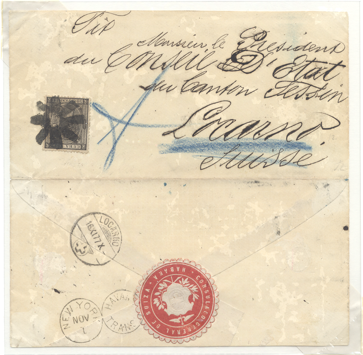
Cover from the Swiss consulate in Havana to Locarno, Switzerland. The cover was routed via New York where it was applied a rare "NEW YORK -- HAVANA TRANSIT" double circle date stamp.