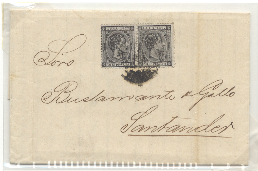
50 c. black 1877 stamps paying the single and double weight rates on letters to Santander, Spain.