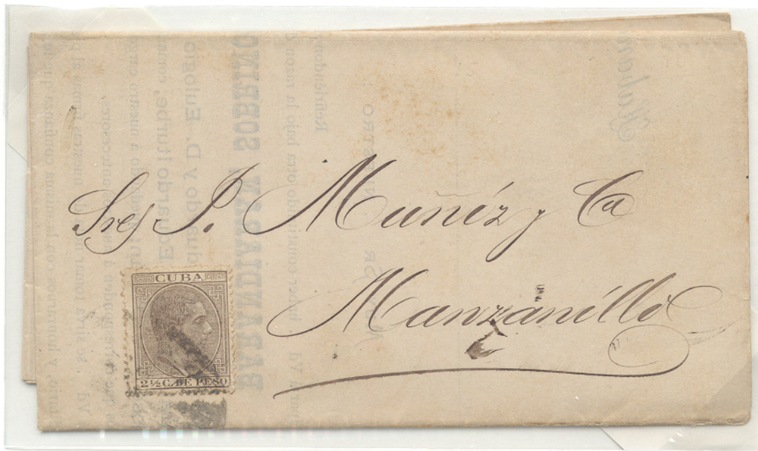
Two circulars to Manzanillo, Oriente province, franked with 2½ c. de peso dark brown stamps paying the rate for circulars. One circular originated in Santiago de Cuba and the other one in La Habana.