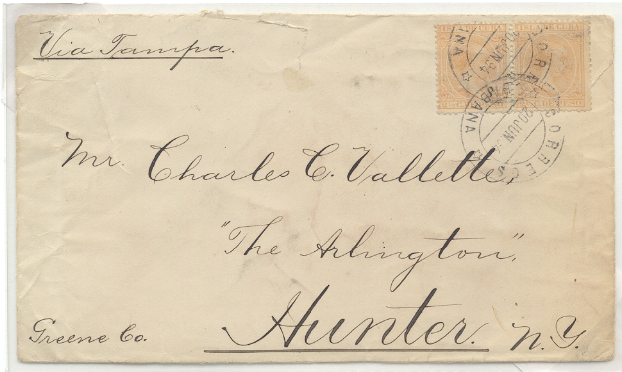
Pairs of 2½ c. de peso salmon stamps properly paying the 5c. single weight letter rate within the island and to the U.S.