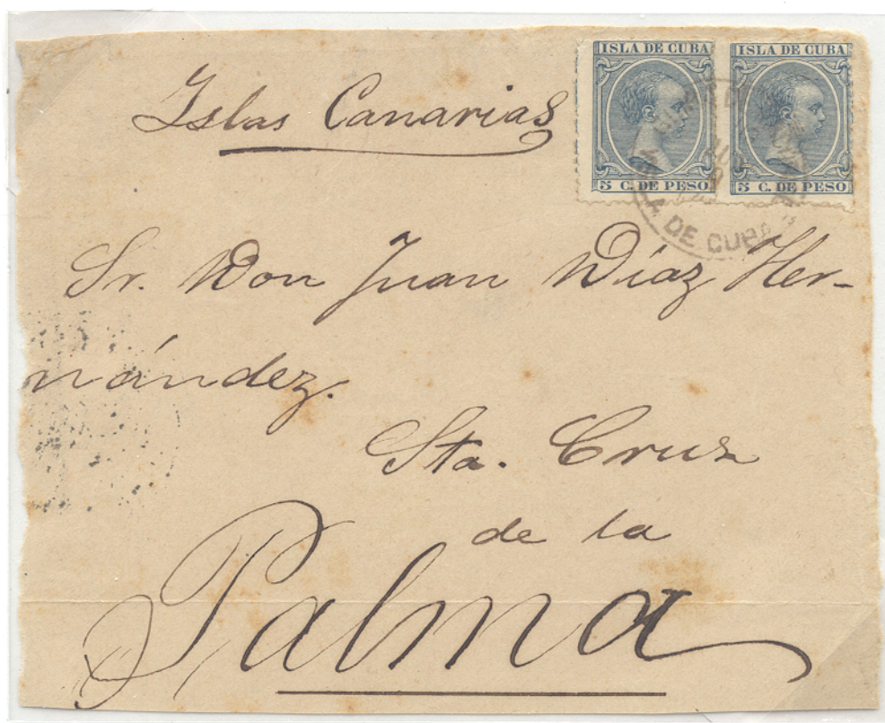
Horizontal pair of the 5c. ultramarine stamps with the left stamp showing a dent in the left corner of the bottom frame line (constant plate variety; plate position VII-2) on a cover front from Güira de Macurijes, Matanzas, to Sta. Cruz de la Palma, Canary Islands.