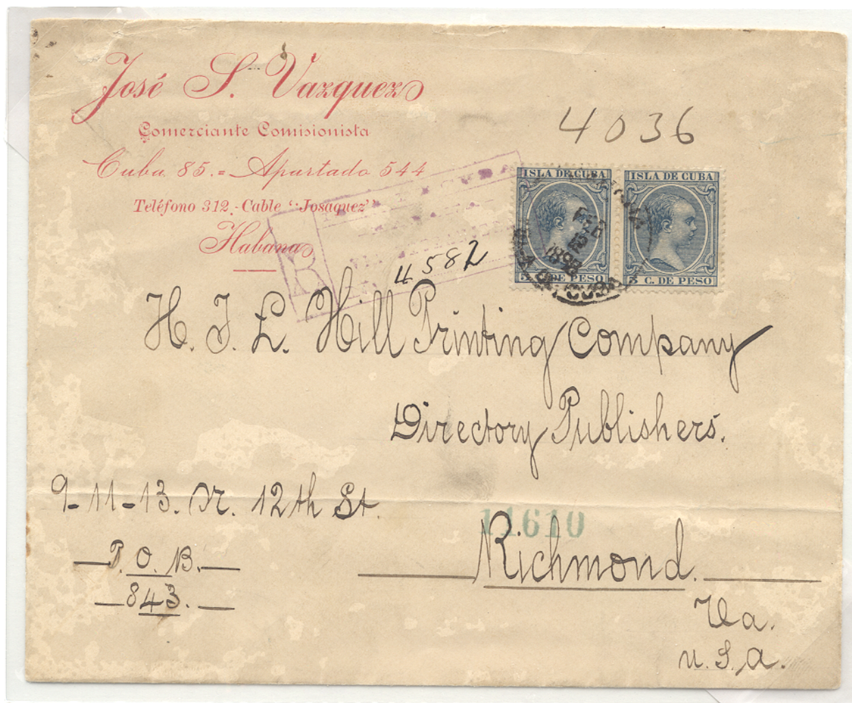
Single weight registered cover dated 12 February 1898 from Habana to Richmond, Virginia, franked with a horizontal pair of 5c. ultramarine stamps paying the 5c. single weight letter rate to the U.S. plus the 5c. registry fee. Note the light purple rectangular registry marking reading "R / Isla de Cuba / Via Extranjera / N. 4582".

5c. ultramarine Registered cover to the U.S.