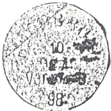
Advertising cover from a cigar manufacturer bearing a single 10c. stamp paying the single weight letter rate to Buchbrunn, Germany, during the U.S. postal administration period. The cover bears an illegible Habana datestamp, but is backstamped with a clear black 9 Dec 98 Rudesheim (Rhein) transit mark and a less clear but legible black 10 Dec 98 Buchbrunn receipt datestamp.