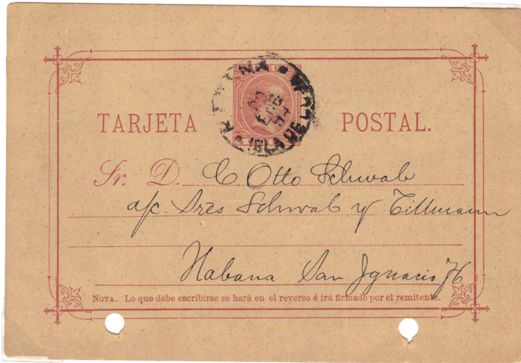
Used in Habana, January 20, 1894.

The Habana firm of Schwab y Tillmann (Beer Importers) used a rudimentary form of a "Rolodex", years before the card filing system was patented in the United States.