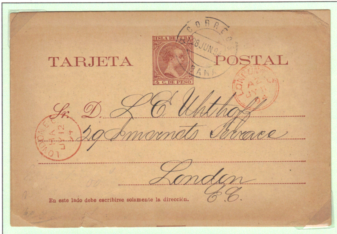
Habana to London, England, June 28, 1894. Red receiving marks: London, July 11, 1894.