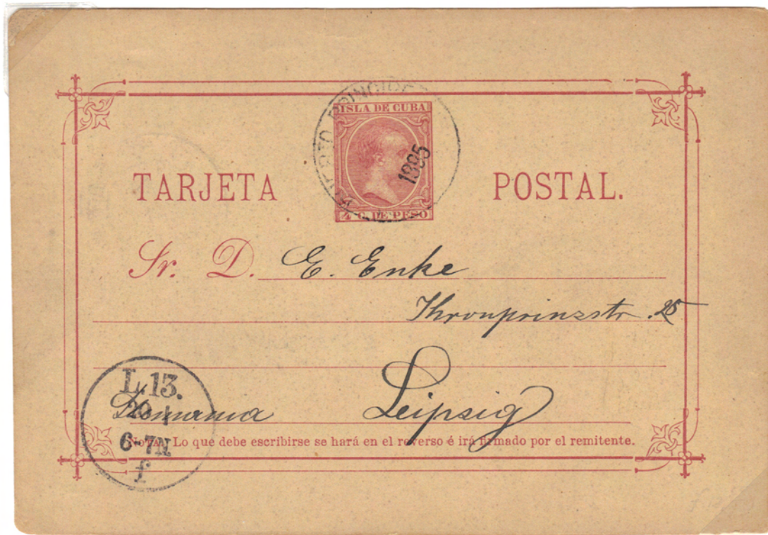
Puerto Principe to Leipzig, Germany, January 4, 1895.