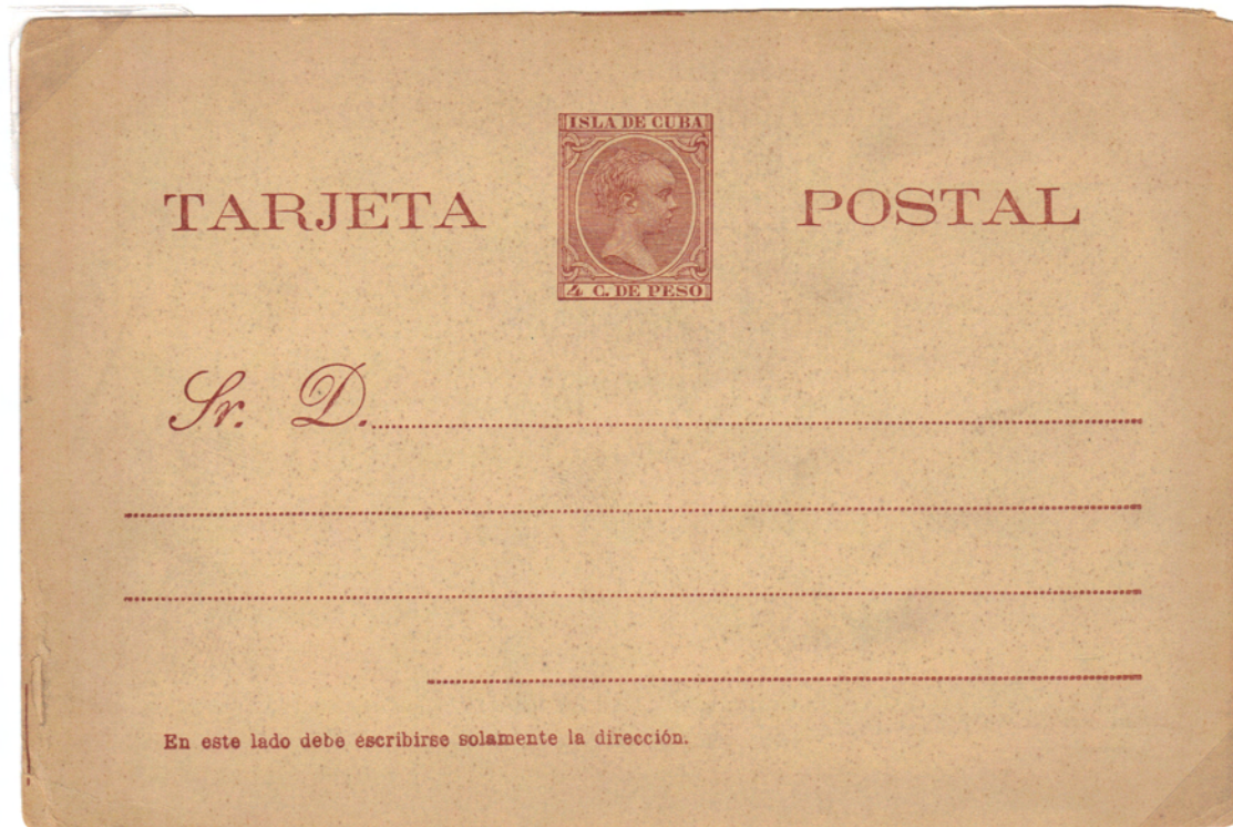
Inverted "s" of solamente.