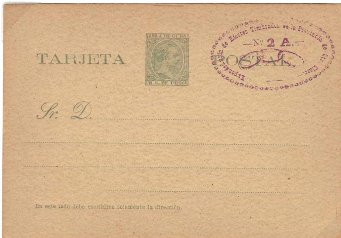
Yet a different purple handstamp from Expendeduría No. 2A, Santa Clara Province. This is a similar oval design showing three chain links, signifying Unity/Strength.