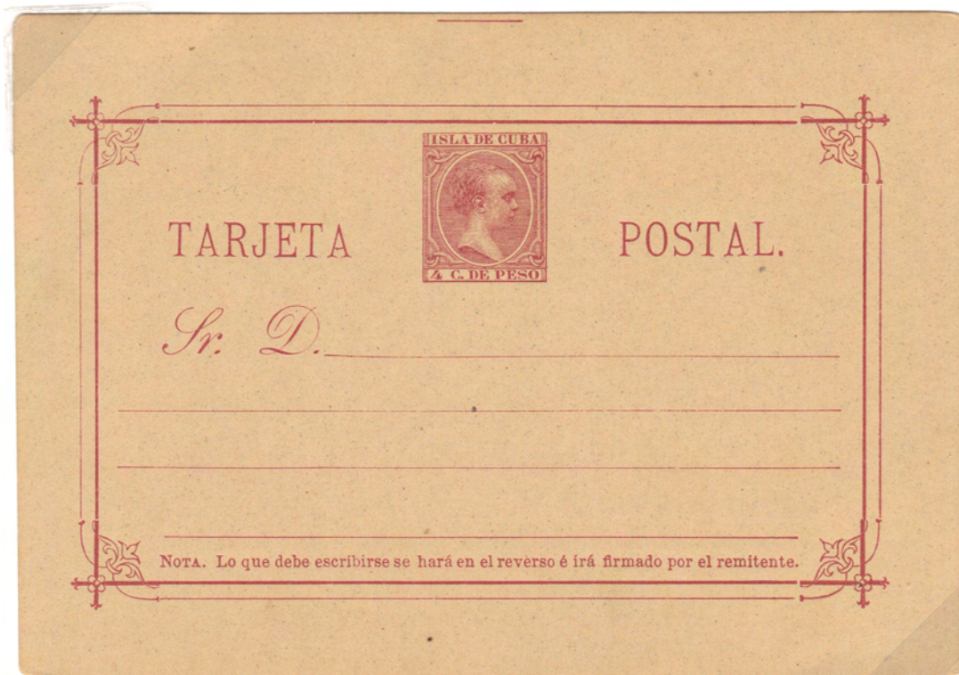
4 c. carmine, Type I-A.