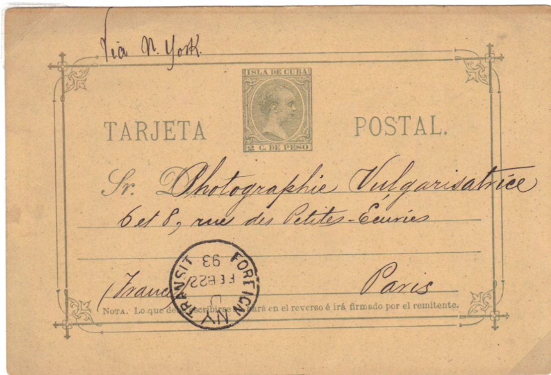
Cardenas to Paris, France, February 17, 1893. Transit mark: New York, February 22, 1893.