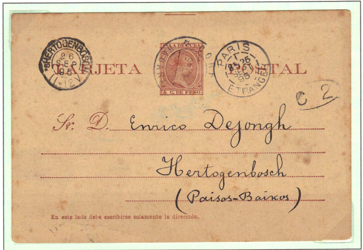
Habana to Hertogenbosch, Paises Bajos (Netherlands), September 9, 1895. Transit mark: Paris, France Sept. 25, 1895. Receiving mark: sHertogenbosch, Sept. 26, 1895.

Most mail to Europe used either the "old" (1882) 3 c. UPU cards or the 2 c. cards, with an added 1 c. stamp. Thus, used 4 c. cards are extremely hard to find.