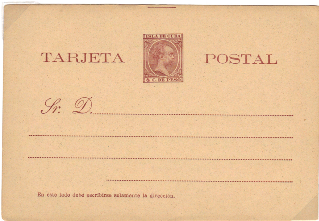
4 c. chestnut.