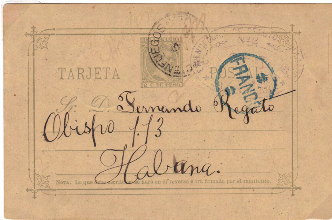
Cienfuegos to Habana, May 5, 1893.