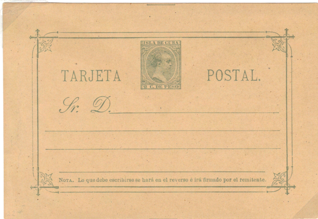
2 c. green, Type I-A.

The Type I-A cards have the "S" of Sr starting to the right of the first "T" of Tarjeta.