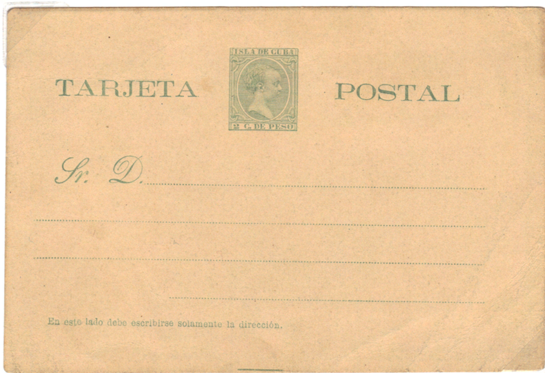
2 c. green.

Similar to the 1890 issue, but the frame has been removed.