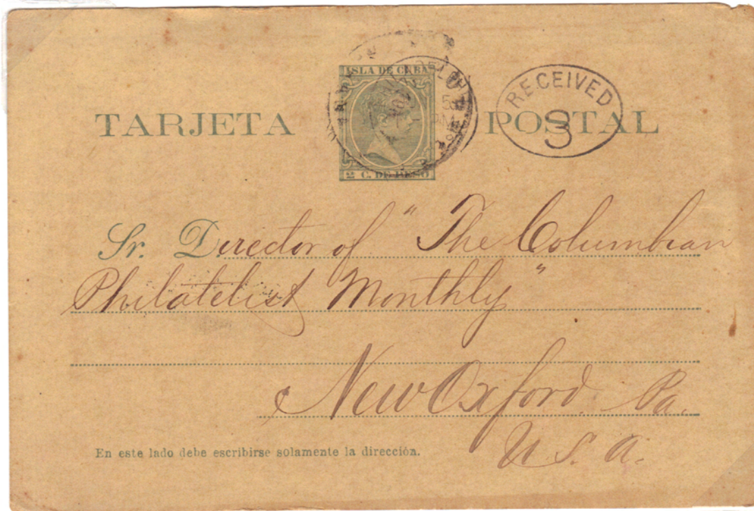
Large "O" of solamente, 1.5 mm instead of 1 mm.

The two typesetting varieties shown below are known for all cards of the 1892 - 1896 issues.