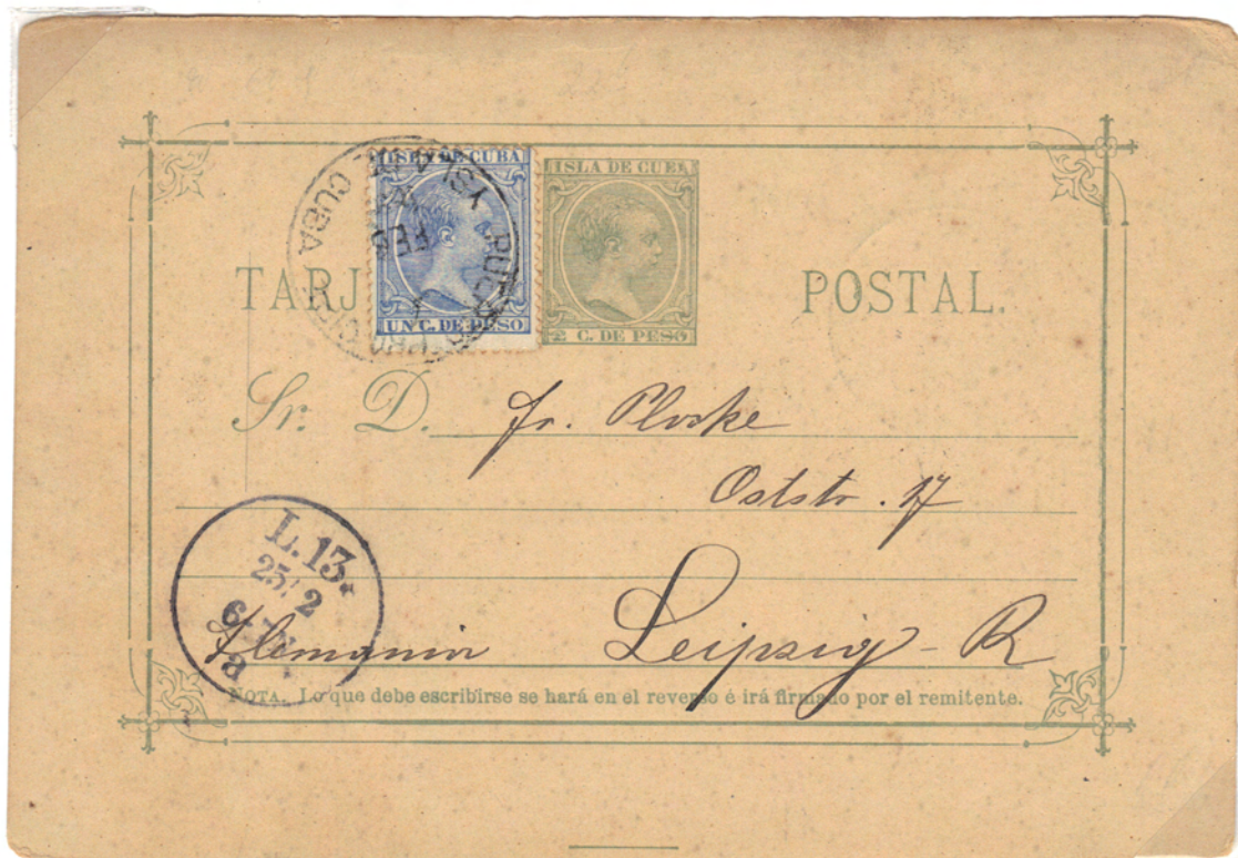
Puerto Principe to Leipzig, Germany, February 10, 1895. Additional 1 c. blue stamp of 1894 paid the rate to Europe.