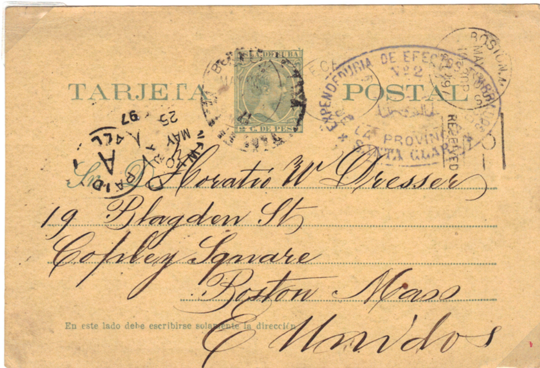
Tunas de Zaza to Boston, MA, May 17, 1897. This card shows a "clasped hands" expendeduría marking from Santa Clara Province office No. 2.