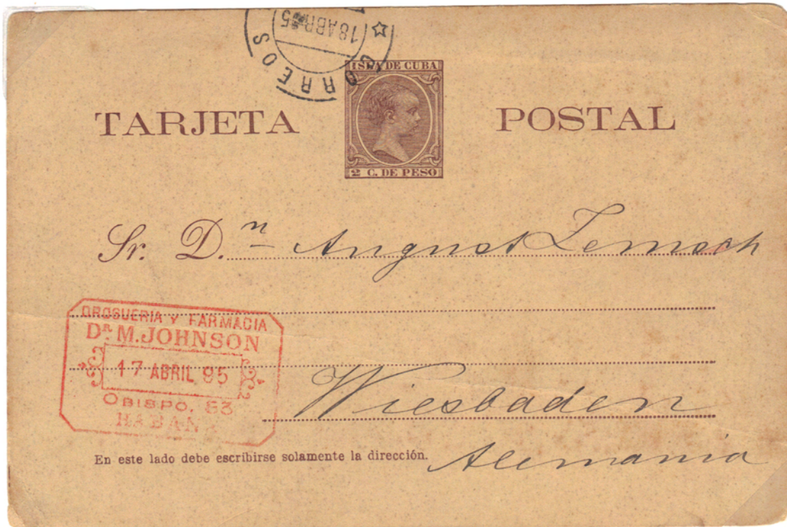
Habana to Weisbaden, Germany, April 18, 1895. Red handstamp of the Dr. Johnson Pharmacy.