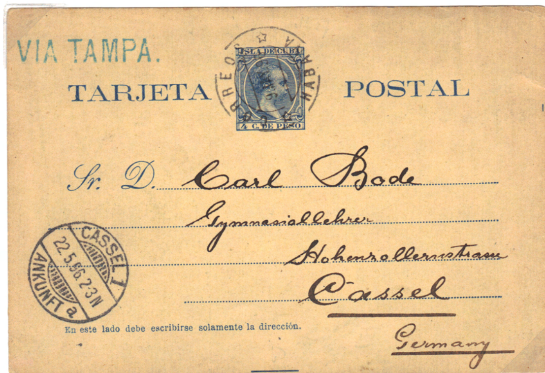
4 c. blue. Habana to Cassel, Germany May 9, 1896.