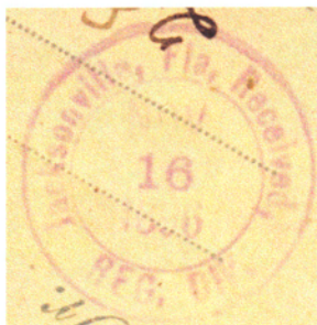
Receiving mark Jacksonville, FL.