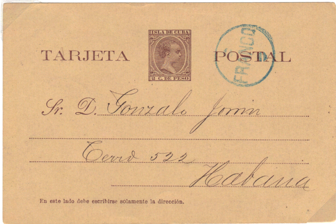
Used within Habana, July 10, 1894. Blue "FRANCO" cancel from pre-stamp period.