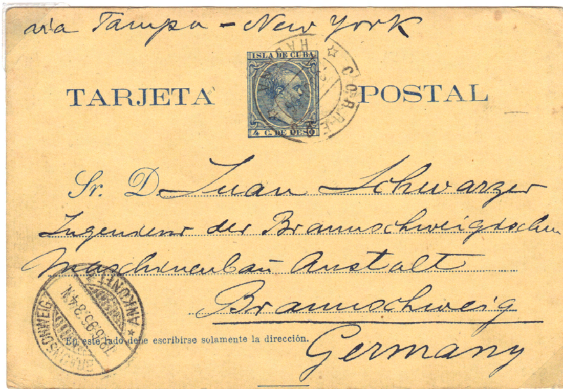
Habana to Braunschweig, Germany, June 3, 1896. Arrived at Braunschweig on June 18th.