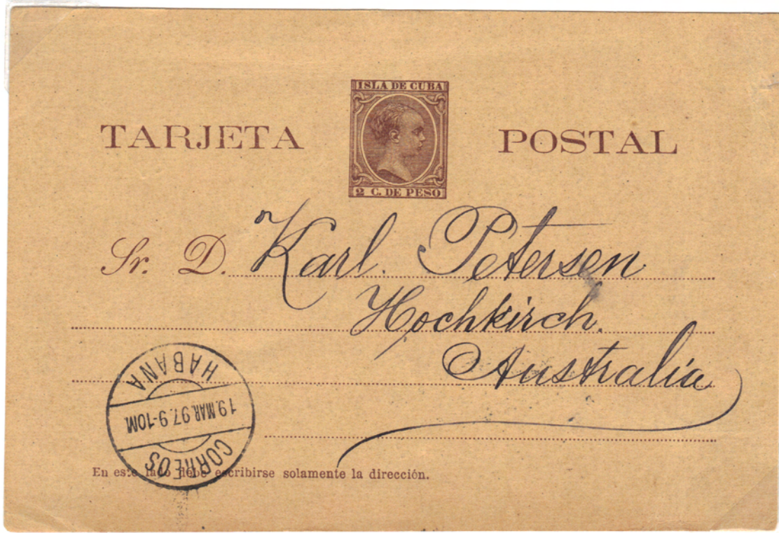
Puerto Principe to Australia, March 17, 1897. Transit marks: Habana, March 19 & London, April 3. Arrived at Australia on May 13.