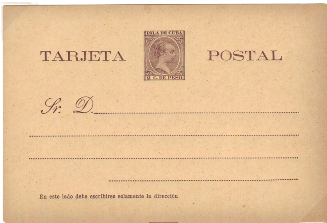
2 c. brown.