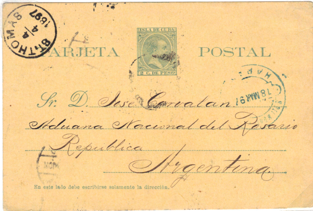
Habana to Rosario, Argentina, March 19, 1897. Via St. Thomas, April 4 & Rio de Janeiro, May 16, arrived at Rosario on May 22.

Mail to Europe was generally two weeks, in contrast, mail to South America was two months!