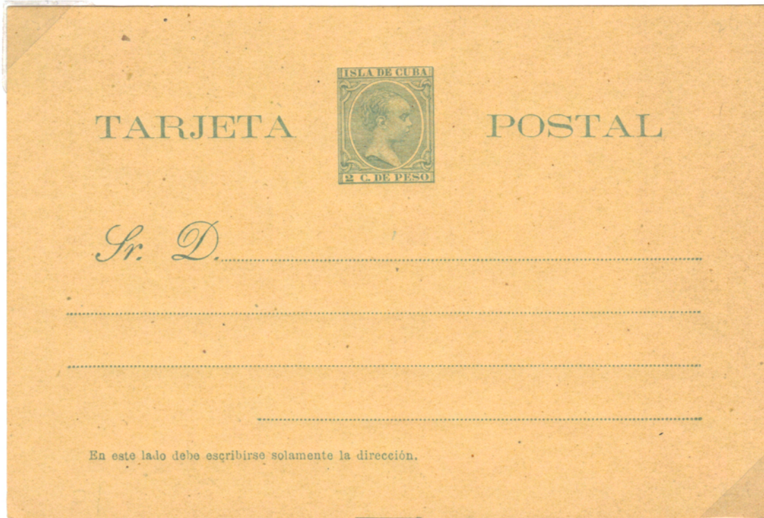
2 c. green on yellow stock. Yellow stock varies in shade with weathering.

The exhibitor co-authored original research that proved conclusively that these cards on yellow stock were a separate printing from the 1892-94 cards. The 1896 date is supported by known usage.