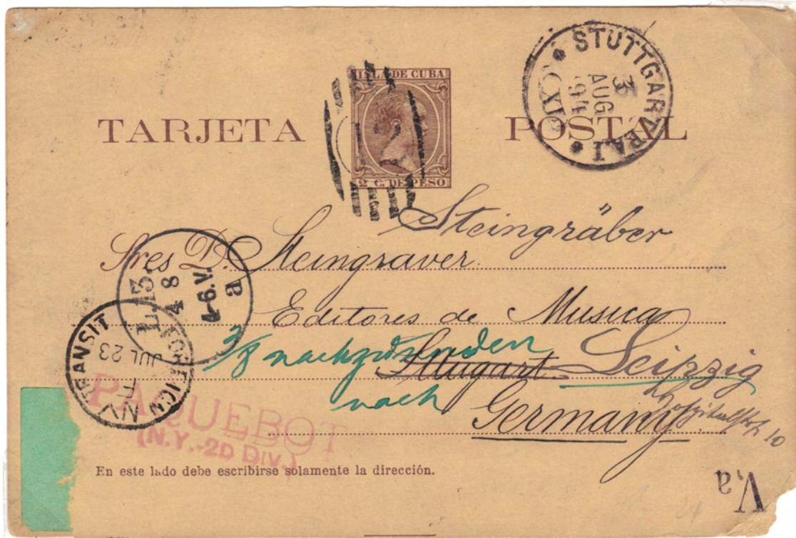
Habana to Leipzig, Germany, July 19, 1894. Forwarded to Stuttgart. Transit mark, New York, July 23. Also red straight line PAQUEBOT (N.Y.- 2d Div.)