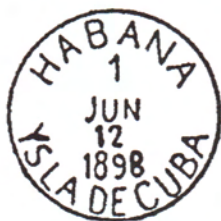
Sample "Ysla de Cuba" numbered circular date stamp.

Registered Use - Matanzas to Milwaukee, WI, November 12, 1896. Registry fee paid by an added 5 c. blue stamp of 1896, tied to the card by a Matanzas, "Ysla de Cuba" numbered circular date stamp. Transit mark Havana, November 12, 1896 (on back). Receiving mark Jacksonville, FL, November 16, 1896 (on front).