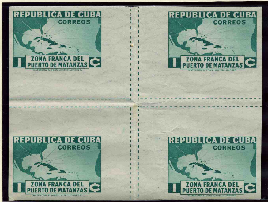
1936 - 1¢ imperforate Matanzas series - Geographical Situation of Cuba on map - Edifil 278CH 200 sheets printed

Two hundred sheets of each of the 14 different imperforate stamps went on sale in only in Matanzas.