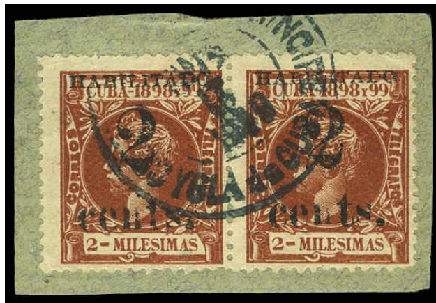
(Full Size Image)