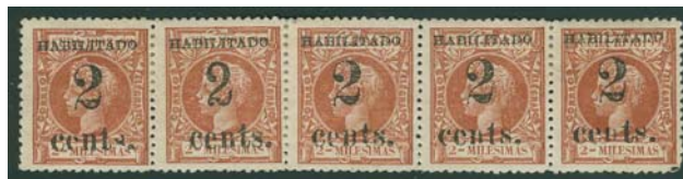
(Full Size Image)