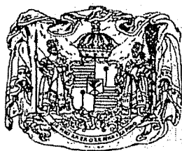
KINGDOM OF HAWAII

($150); 201a tied on piece, well centered $223 ($150); 201a tied on piece $263 ($150); 201b unused $784 ($275); 201b used, toned $112 ($140); 201a var. (201a + 201c var?) single with margin at left, surcharge on stamp and margin, Pos. 2-3, Pos. 3 on margin, tied on piece, toned $437 ($150+); 201 var. single with gutter at right, surcharge on stamp and gutter, Pos. 4-5, Pos. 5 on gutter, tied on piece, stained $459 ($75+); 203b tied on piece, toned $700 ($350); 205a tied on piece $303 ($150); 205a used $386 ($150); 205b used $206 ($150); 206 var. single with margin at right, surcharge on stamp and margin, Pos. 4-5, Pos. 5 on margin, tied on piece $493 ($200+); 211 tied on piece $1,738 ($850); 211a tied on piece $2,408 ($ —); 212 used, stained $1,232 ($1,350); 215a used $471 ($275); 217 unused $1,400 ($1,200); 217a unused $2,408 ($ —); 217b used $1,736 ($450); 217 + 218 pair, Pos. 4-5, tied on cover to New York, Pos. 4 faulty, Pos. 5 badly damaged, cover damaged $3,584 ($1,250+); 218a tied on piece, stained $2,184 ($1,250); 219 used, thin $426 ($600); 219a tied on piece, stained $1,148 ($750); 219b used, thin $1,848 ($750); 220 tied on piece, stained $1,848 ($1,200); and 220 tied on piece $1,680 ($1,200).