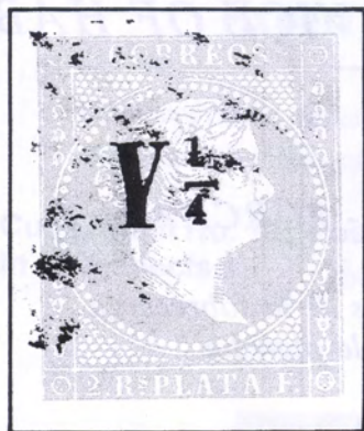
Position No. 25 (8-B)