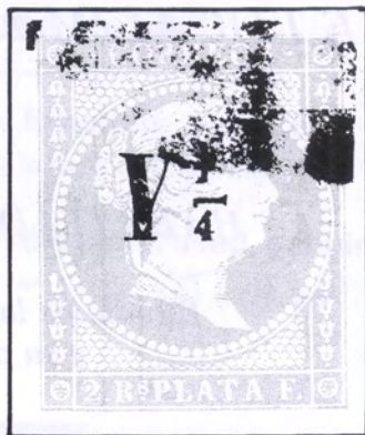
Position No. 32 (15-B)