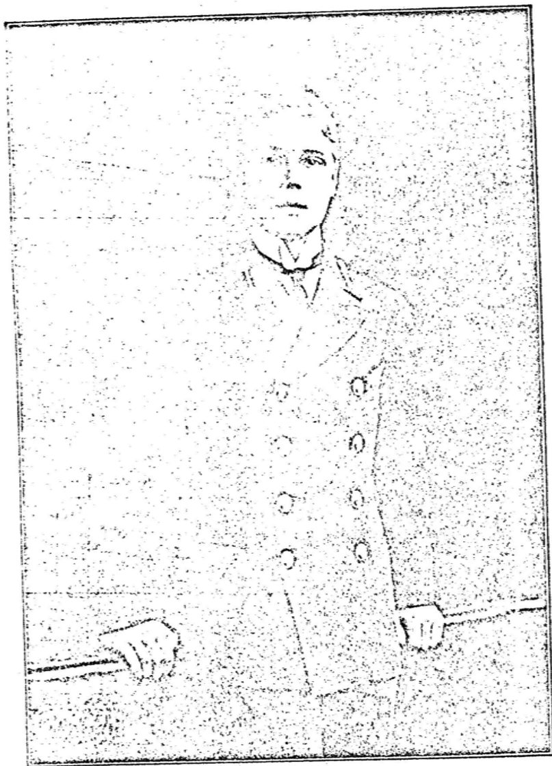
H.R.H. THE PRINCE OF WALES, K.G.