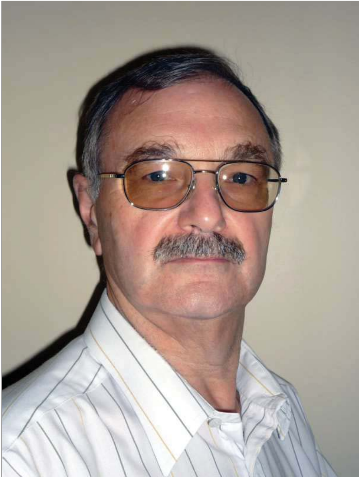
The Author January 2013