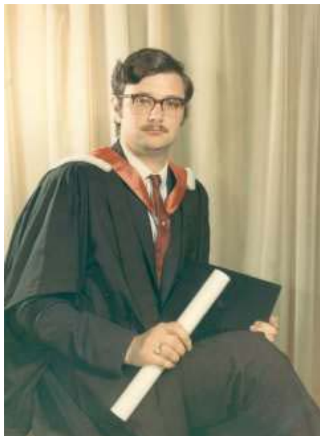
The author, upon receiving his Bachelor of

Following his schooling, he attended the Department of Metallurgy at the University of Liverpool in 1967, graduating three years later with a B.Eng. Following two years research, he received his Masters degree (M.Eng.) The next seven years were spent in the same Department carrying out industrial research into the heat treatment of metals. He eventually left to join a small private company, Nemo Heat Treatments Ltd.