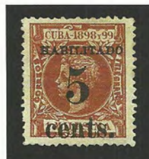
Scott 182. P.F. certificate. Ex.-Tows.