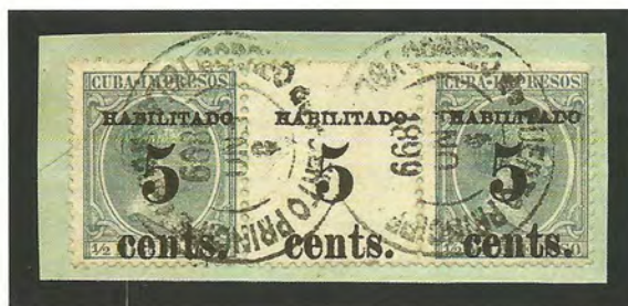
Scott 190. Signed Bloch. Ex.-Tows.