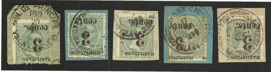
Scott 201a (4), 202a.