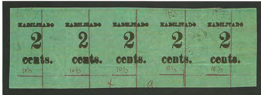
Trial impression of the complete setting of five on green paper. Only three are recorded. 1989 P.F. certificate.