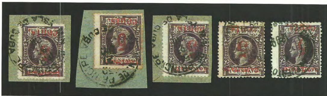
Scott 198a (4) and 199a.