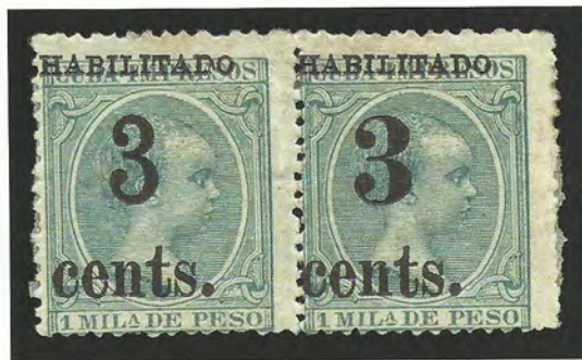
Scott 202, 201.