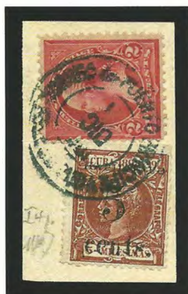
Scott 188 and U.S. 279c. P.F. certificate. Ex.-Tows.