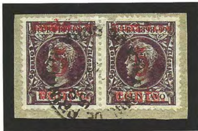
Scott 198c, 199c. Ex.-Tows.