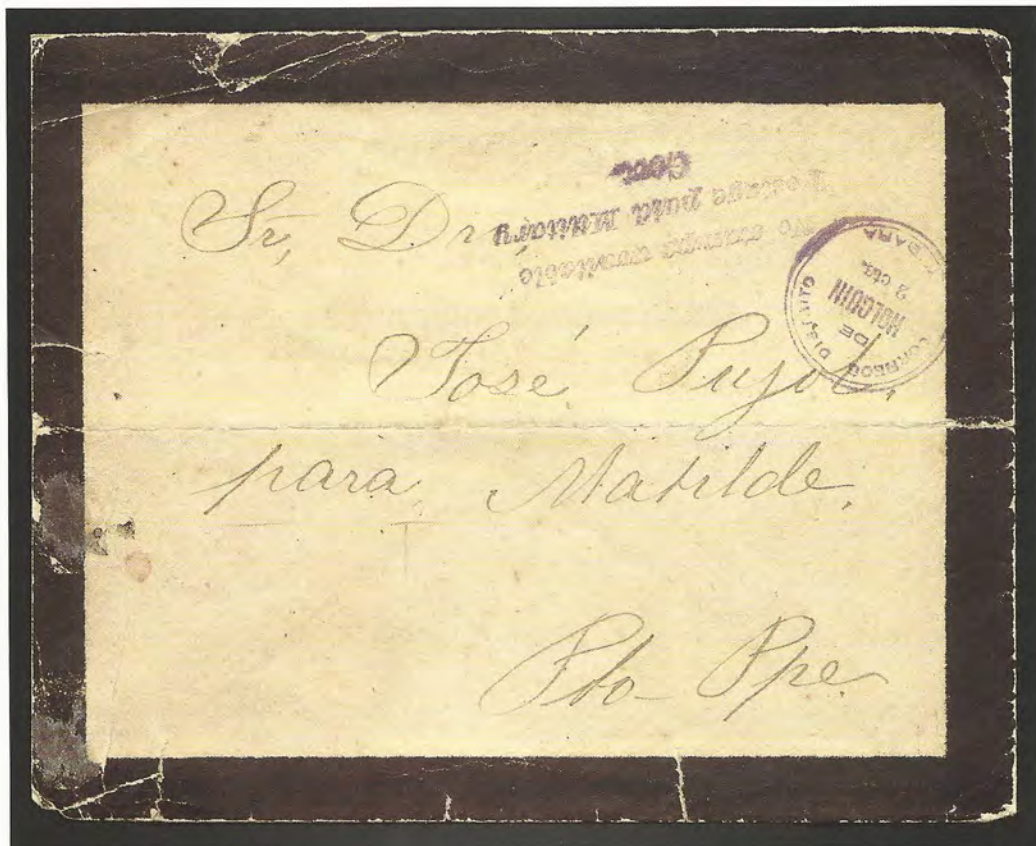
"No stamps available/Postage paid Military/Govt."