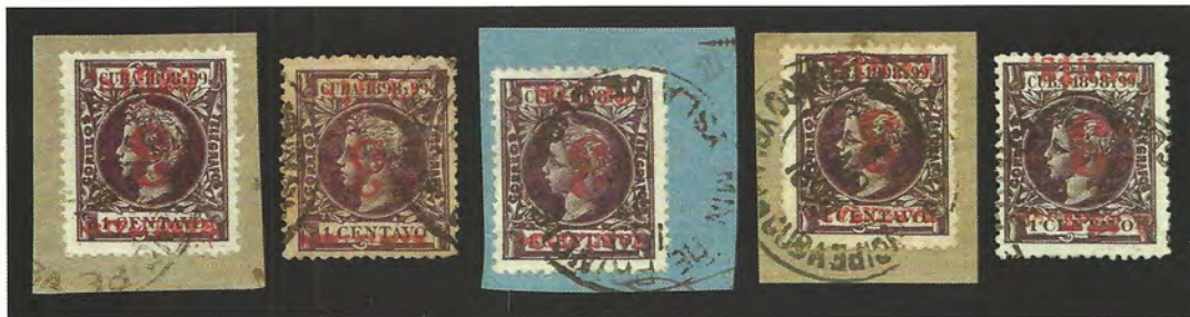
Scott 196a (4) and 197a.