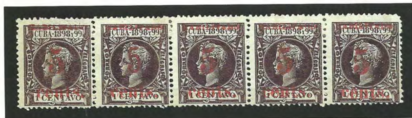
Scott 198 (4) and Scott 199.