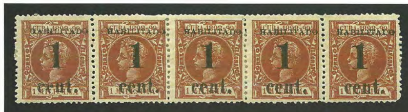
Scott 176 1975 P.F. certificate. Ex-Tows.