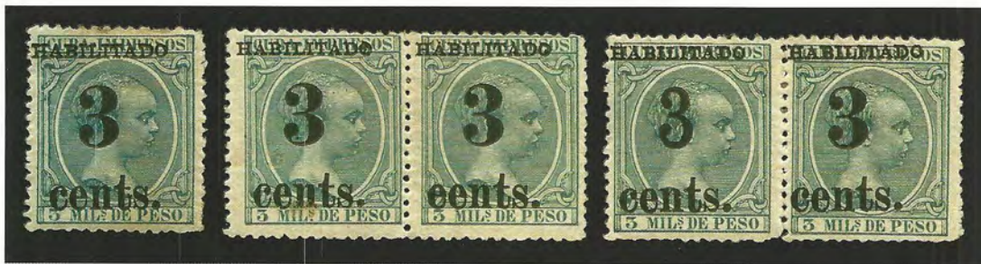
Scott 205 (3), position 3 with "eents" variety Scott 205b and 206.