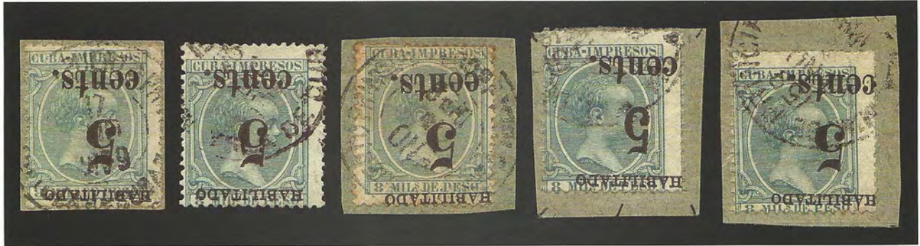
Scott 219a (3), position 3 with "cents" variety, Scott 219c and position 4 is Scott 220a.