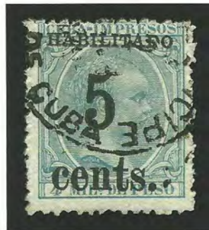
Scott 218. Signed Economist.