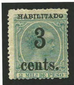
Scott 204. A.P.S. certificate. Ex.-Tows.