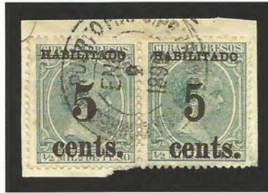
Scott 190, 191. Signed Bloch.