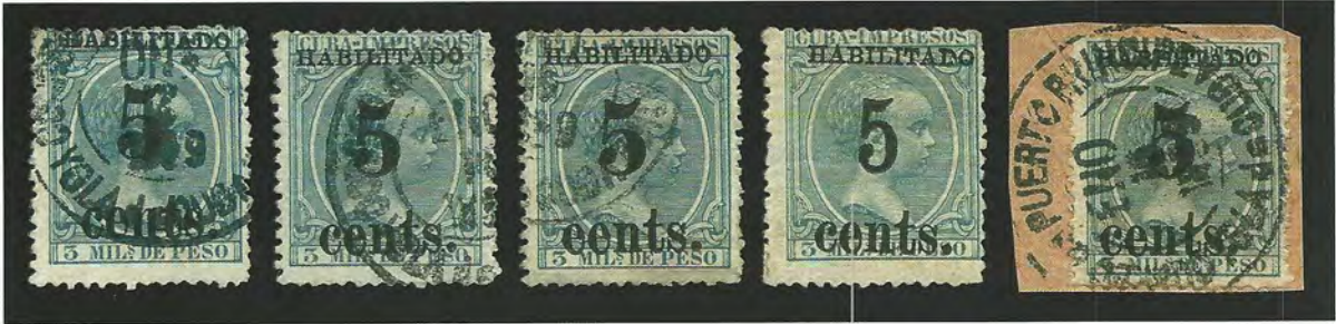
Scott 215 (3), position 3 shows the "cents" variety, Scott 215a, and position 4 is an extremely rare mint copy of Scott 216.