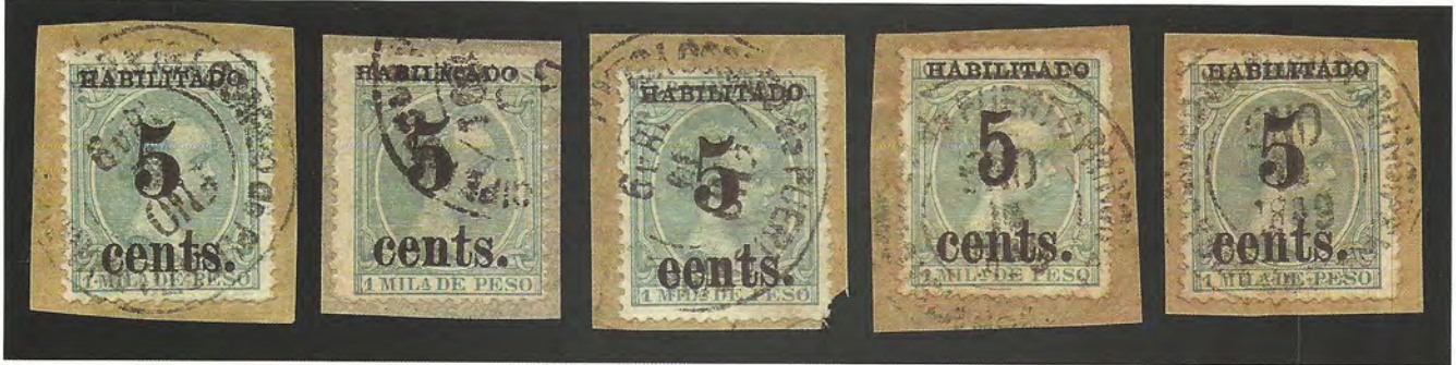
Scott 211 (3), position 3 with "eents variety", Scott 211a, and Scott 212.