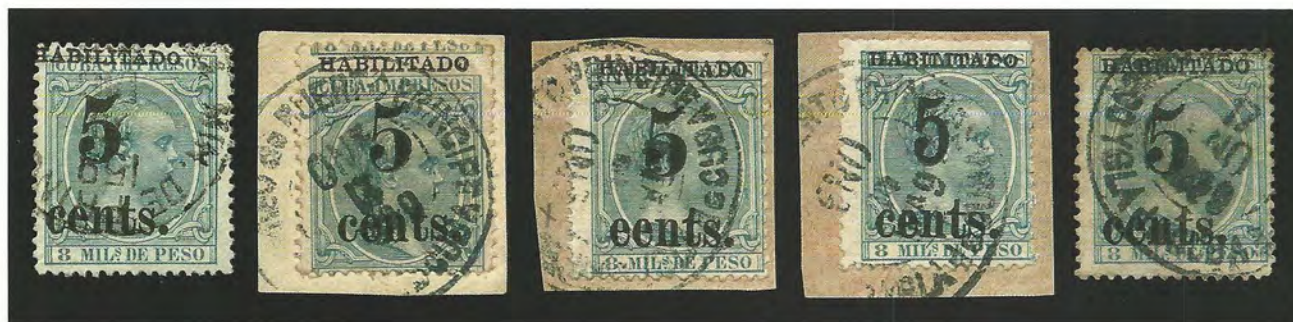
Scott 219 (3), position 3 with "cents" variety, Scott 219b and position 4 is Scott 220.