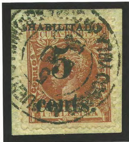
Formerly Scott 183B. P.F. certificate. Ex.-Tows.