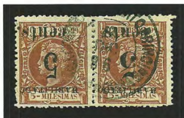
Scott 188a, 189a.