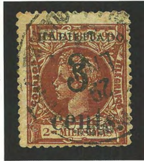
Scott 179G. P.F. certificate.