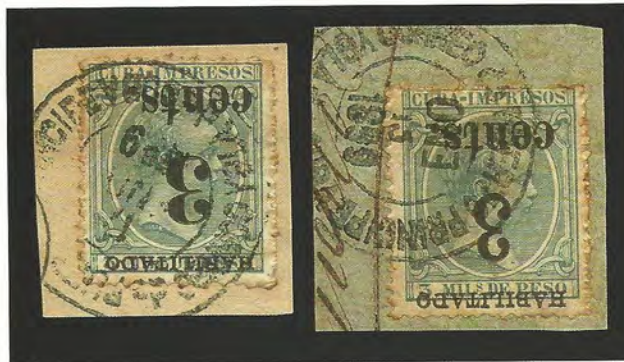
Scott 205a, 206a. Each signed Scott Stamp & Coin.