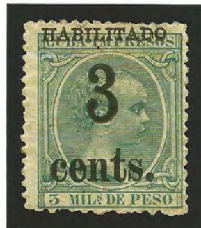
Scott 206. A.P.S. certificate. Ex.-Tows.