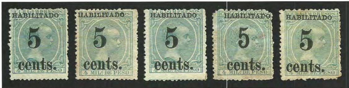
Scott 217 (3), position 3 with the "cents" variety, Scott 217a and 218.