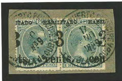
Scott 201 Var., 202 Var.