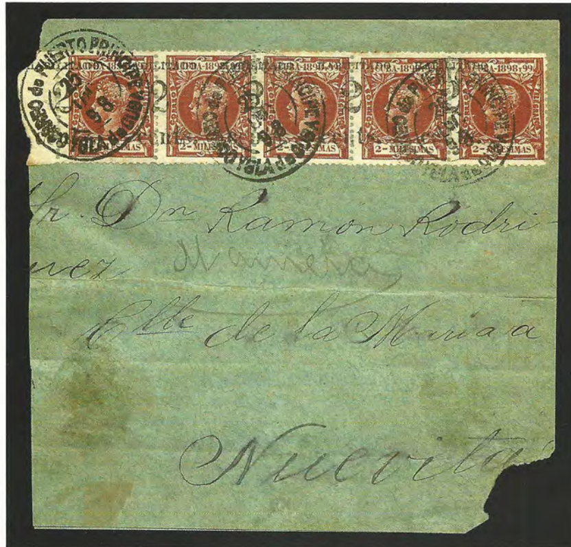
Scott 178. Ex.-Tows.