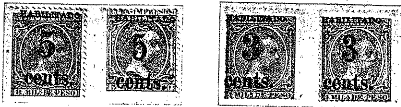
i j k l