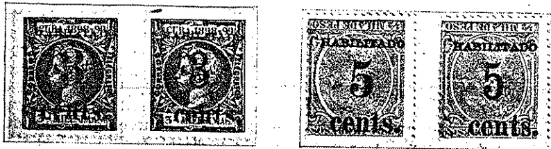
e f g h